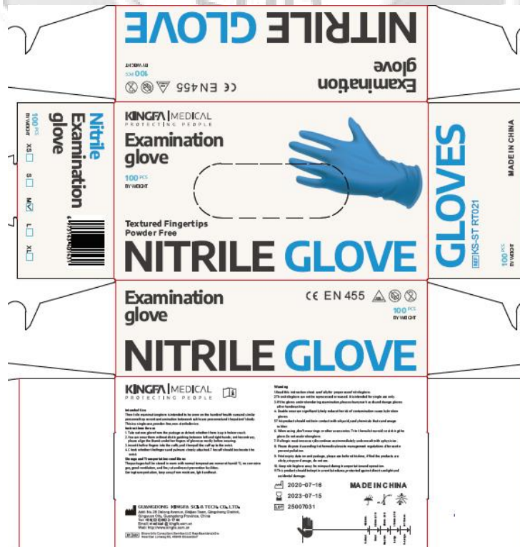
Photo 2: Packaging artwork for Nitrile Examination Glove, KS-ST RT021, Blue, Size M